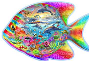
NEW - Art. No. 503284 - Magic Fish L

Puzzle size: 10" x 14.75" Packaging size: 6" x 4.9" x 4.9" Number of parts: 250 Number of Whimsies: 40