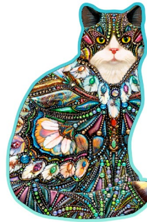
NEW - Art. No. 503276 - The Jeweled Cat L

Puzzle size: 10" x 14.75" Packaging size: 6" x 4.9" x 4.9" Number of parts: 250 Number of Whimsies: 40