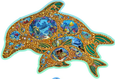
NEW - Art. No. 503274 - Jewels of the Sea L

Puzzle size: 10" x 14.75" Packaging size: 6" x 4.9" x 4.9" Number of parts: 250 Number of Whimsies: 40