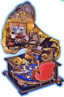
NEW - Art. No. 503278 - Cozy Gramophone L

Puzzle size: 10" x 14.75" Packaging size: 6" x 4.9" x 4.9" Number of parts: 250 Number of Whimsies: 40