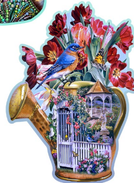
NEW - Art. No. 503280 - Secret Watering Can L

Puzzle size: 10" x 14.75" Packaging size: 6" x 4.9" x 4.9" Number of parts: 250 Number of Whimsies: 40