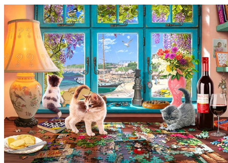
NEW - Art. No. 503265 - Puzzler's Desk XL

Puzzle size: 20.43" x 14.76" Packaging size: 7.87" x 6.57" x 6.57" Number of parts: 1010 Number of Whimsies: 100