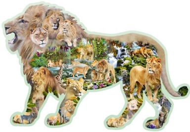
NEW - Art. No. 503270 - Lion Roar L

Puzzle size: 10" x 14.75" Packaging size: 6" x 4.9" x 4.9" Number of parts: 250 Number of Whimsies: 40