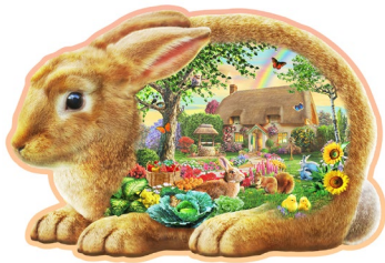
NEW - Art. No. 503282 - Garden Bunny L

Puzzle size: 10" x 13.75" Packaging size: 6" x 4.9" x 4.9" Number of parts: 250 Number of Whimsies: 40