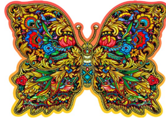
NEW - Art. No. 503272 - Royal Wings L

Puzzle size: 10" x 14.75" Packaging size: 6" x 4.9" x 4.9" Number of parts: 250 Number of Whimsies: 40