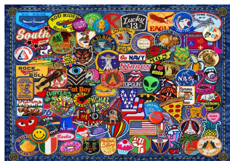
NEW - Art. No. 503264 - Patch Crazy XL

Puzzle size: 20.43" x 14.76" Packaging size: 7.87" x 6.57" x 6.57" Number of parts: 1010 Number of Whimsies: 100